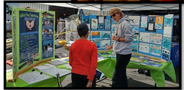
Sharing artwork at school and SeaFeast.